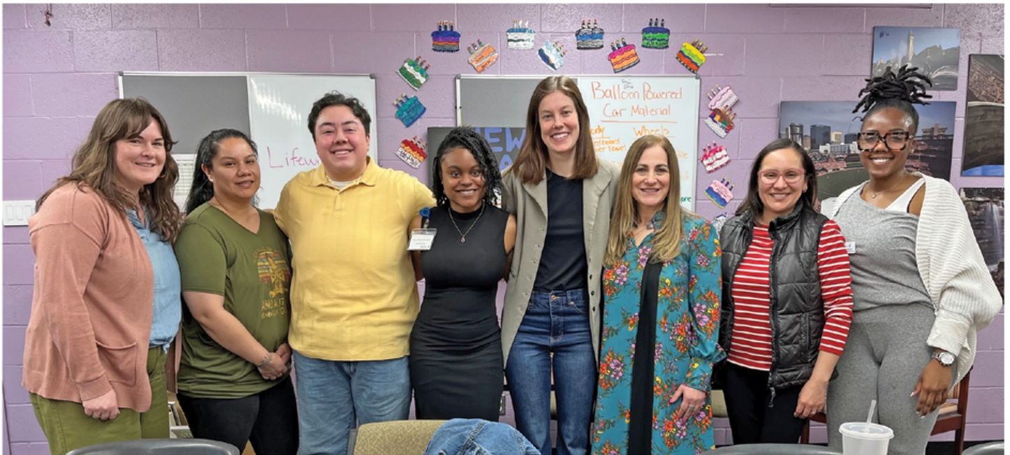
(Pictured Above) The HHB Team and the LifeWise Economic Wellness team working together to help families and individuals thrive