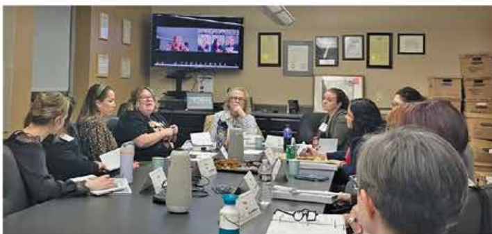
(Pictured Right) Leadership class members finding JOY!

Congratulations to those who completed our 2025 Leadership Class! Members enhanced their skills and learned best practices to navigate through situations that may arise in leadership roles. Planning for the 2027 Leadership Class is already underway!