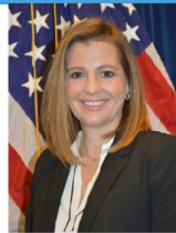
Saylor Fleming - United States Attorney