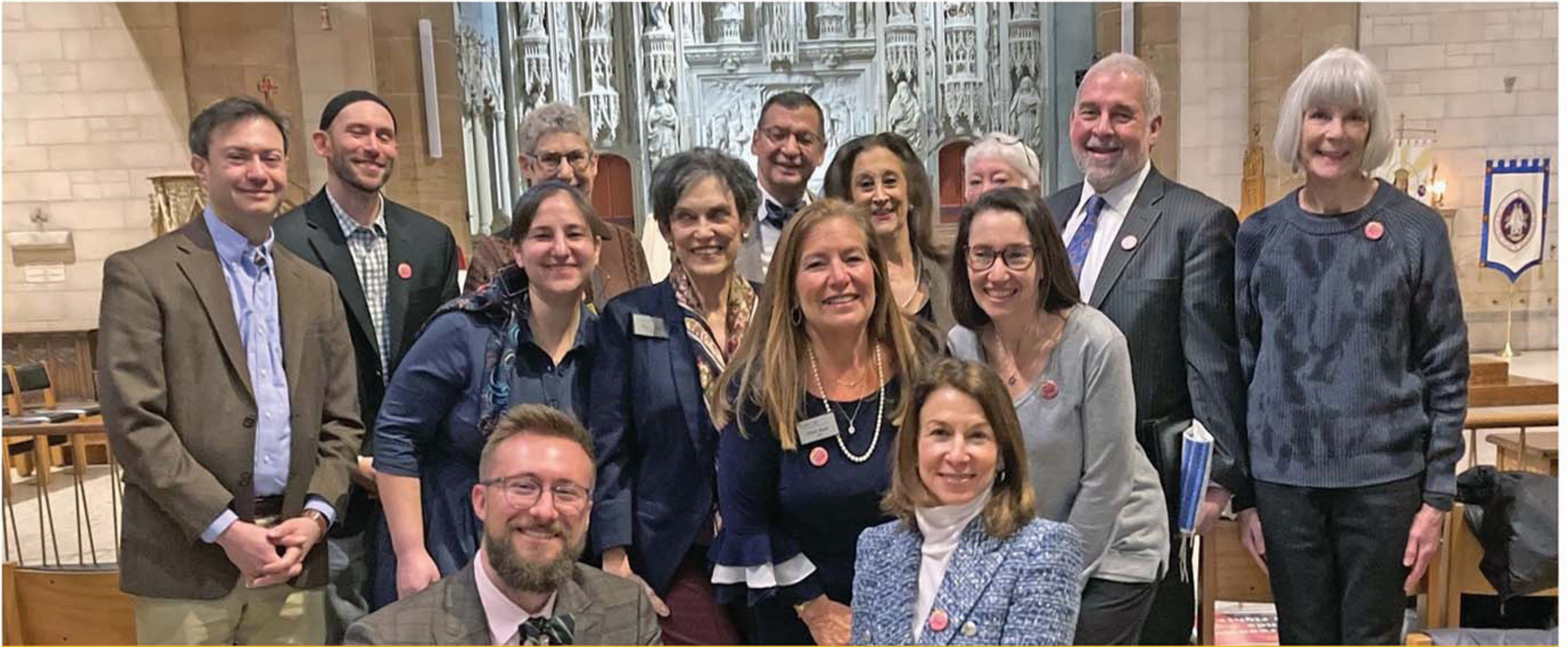
Coalition of Jewish Groups support lawsuit opposing MO Abortion Ban (see page 5)

VOLUME 100 • ISSUE 3 • WINTER 2022-SPRING 2023