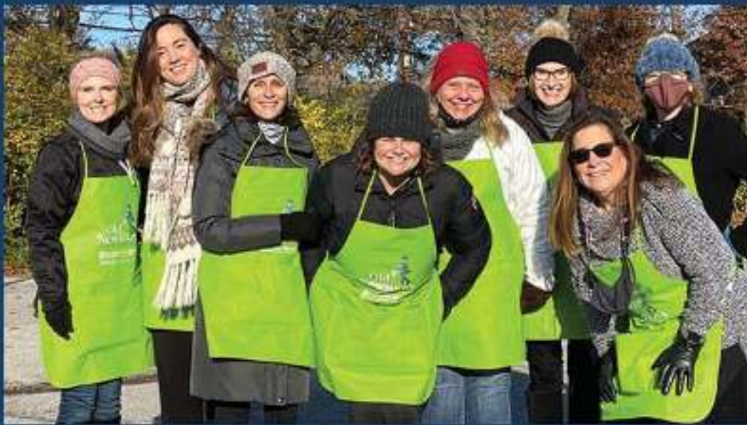
NCJWSTL staff at Old Newsboys 2021