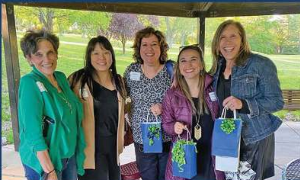
2021 Leadership Class attendees