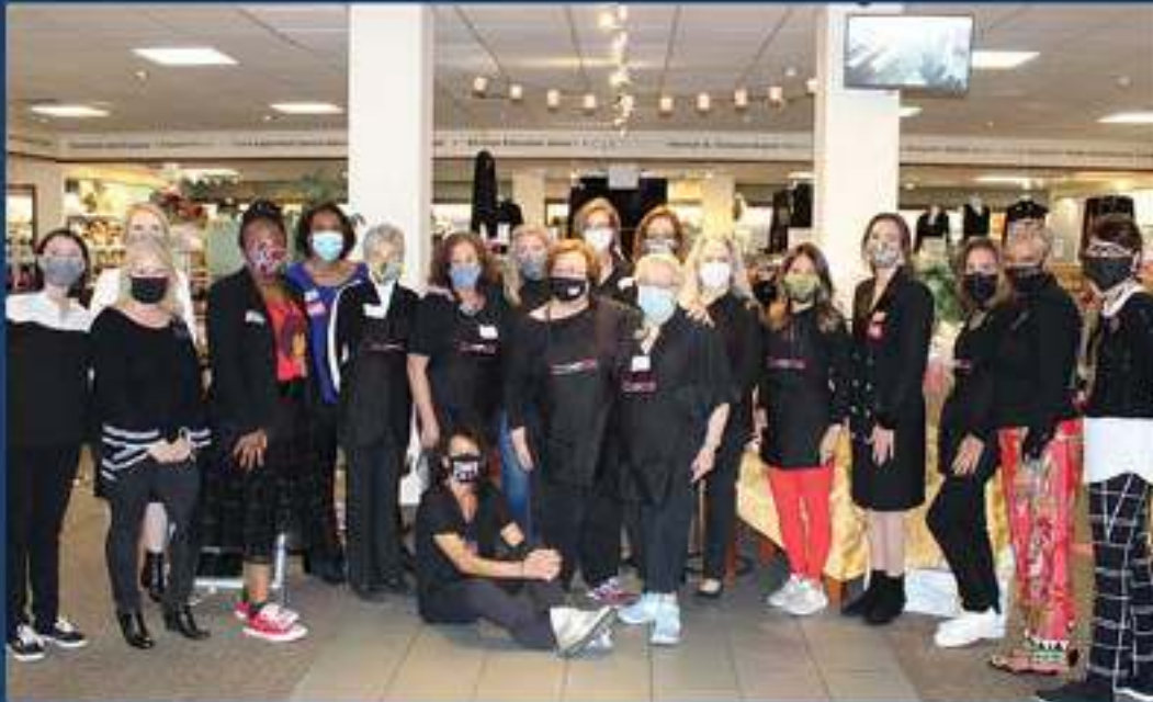
The Resale Shop staff and volunteers at Couturier 2021