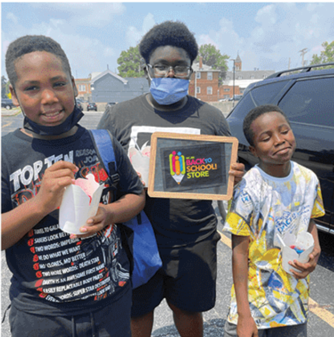
(Top) Volunteers at New Life Empowerment Center receiving backpacks and supplies