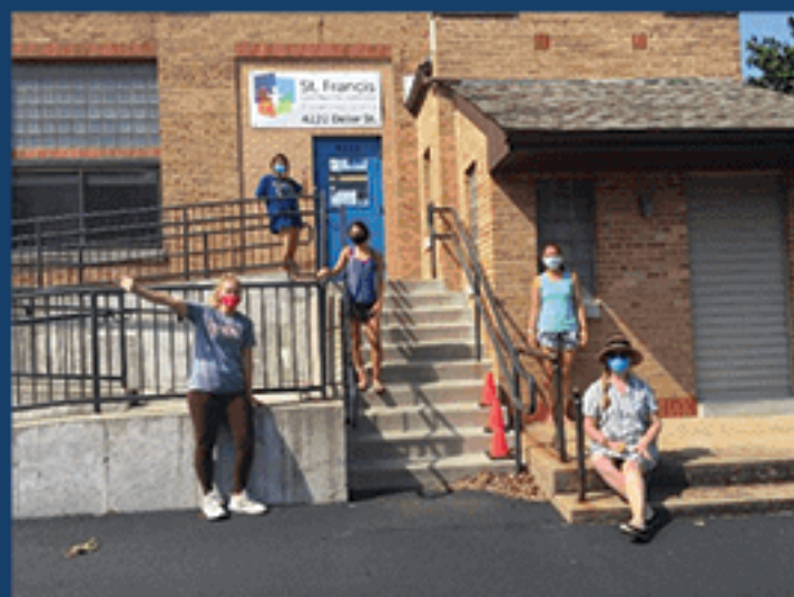
Partner agency, St. Francis Community Services