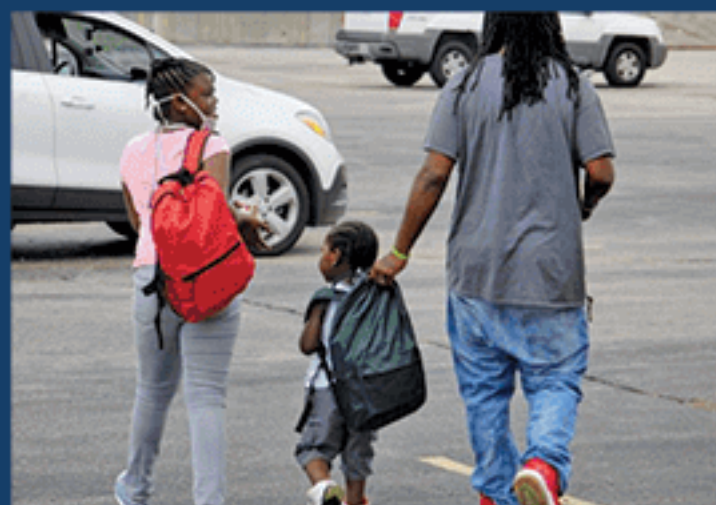
Backpack delivery at SoulFisher