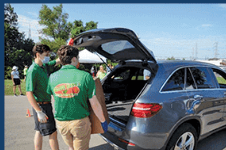
Cars being loaded by staff at College Hunks Hauling Junk & Moving Mi-Box Mobile Storage campus