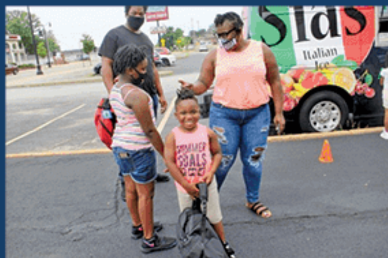
Backpack delivery at SoulFisher